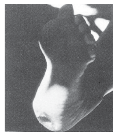
Large hole down to the bone in the foot of a woman with a bone infection (osteomyelitis). She has had this injury since childhood 30 years before.

WARNING: The pus from the infected bone may cause serious infections in other persons. Wash hands often. Wear gloves when handling anything with blood or body fluids on it. Take great care with hygiene .