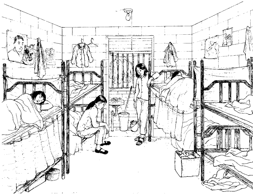
TB can spread rapidly when people live in crowded dormitories with poor ventilation.