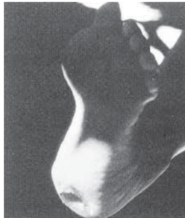
Large hole down to the bone in the foot of a woman with a bone infection (osteomyelitis). She has had this problem since childhood 30 years before.

WARNING: The pus from the infected bone may cause serious infections in other persons. Wash hands often. Wear gloves when handling anything with blood or body fluids on it. Take great care with hygiene.