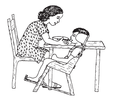
Special seating can help the severely disabled child by supporting him in a position where he has better control.

Special seating and positioning, discussed in Chapter 65, may help the child to have more control of her body. This can make feeding, basic communication, and other activities easier.