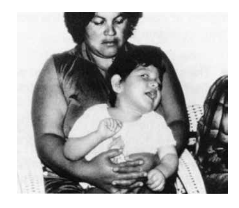
A child with severe cerebral palsy, who is also blind, has seizures, and is mentally slow.

Caring for multiply and severely disabled children is never easy; they need an enormous amount of time, patience, and love. In most communities, parents and close family members will be the main care providers. But parents will need a lot of support from the community in order to care adequately for the child. Unless parents have help, they are likely to find that the