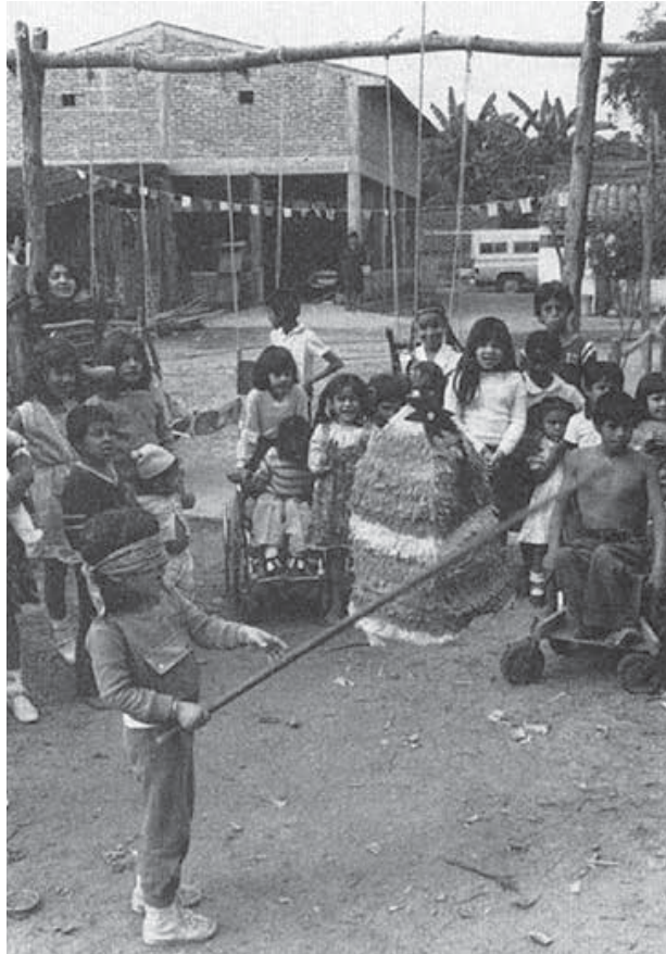
A community rehabilitation program finds enjoyable ways to bring disabled and non-disabled children together. Here the village children have been invited to the birthday party of a disabled child. They take turns, blindfolded, trying to break a 'piñata' (a papier-mache toy filled with candy and nuts).

It must be remembered that opportunities for a close, loving relationship are only one aspect of leading a full, accepted, and participating life in the community. The more that can be done to bring about greater integration and participation of disabled persons in the life of the community, the more everyone will learn to look beyond a disability and see the person. When this happens, it opens up many new possibilities.