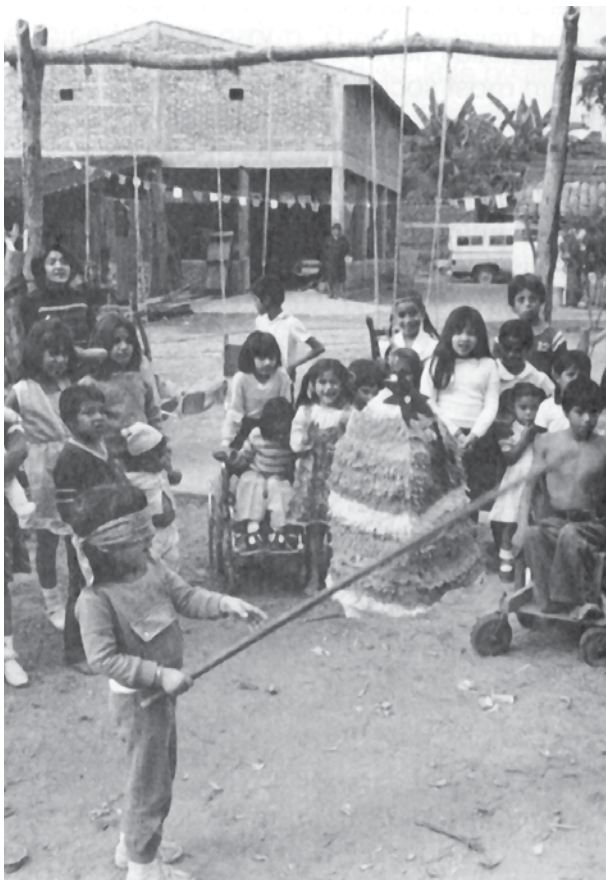
A community rehabilitation program finds enjoyable ways to bring children with and without disabilities together. Here the village children have been invited to the birthday party of a child with disabilities. They take turns, blindfolded, trying to break a “piñata” (a papier-mache toy filled with candy and nuts).

Young people with disabilities should be given the same information and opportunities as young people without disabilities to avoid unwanted pregnancy and sexually transmitted infections such as HIV. Making such information and methods available may be of special importance for participants in a self-run community rehabilitation program. For different methods of family planning, see A Health Handbook for Women with Disabilities , Chapter 9, or Where Women Have No Doctor , Chapter 13 (see p. 642).