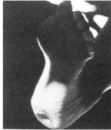
Large hole down to the bone in the foot of a woman with a bone infection (osteomyelitis). She has had this injury since childhood 30 years before.

WARNING: The pus from the infected bone may cause serious infections in other persons. Wash hands often. Wear gloves when handling anything with blood or body fluids on it. Take great care with hygiene.