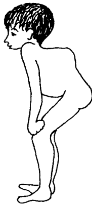
As the spine collapses forward, the child may have to hold himself up using his arms.

If a child begins to develop a sharp bend in the middle section of the backbone, with shortening and thickening of the chest, it is probably tuberculosis of the spine. You can almost be sure it is, if someone in the family has TB of the lungs.