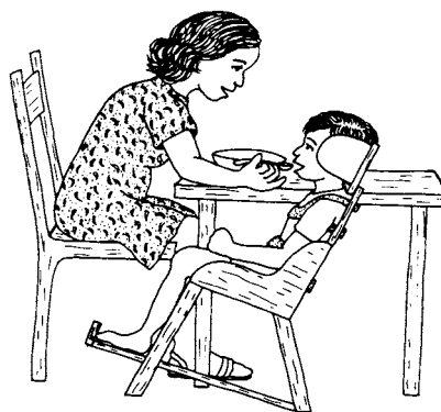
Special seating can help the child with severe disabilities by supporting him in a position where he has better control.

Special seating and positioning, discussed in Chapter 65, may help the child to have more control of her body. This can make feeding, basic communication, and other activities easier.