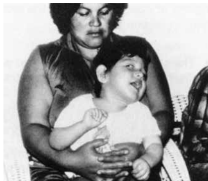
A child with multiple disabilities, including severe cerebral palsy, vision loss, seizures and cognitive delay.

Caring for children with multiple and severe disabilities is never easy; they need an enormous amount of time, patience, and love. In most communities, parents and close family members will be the main care providers. But parents will need a lot of support from the community in order to care adequately for the child. Unless parents have help, they are likely to find that the continual demands of caring for their child are too much. Even the most loving parents, after months and years of continuously caring for a child with severe disabilities, can easily become frustrated and angry. This is especially true when the child shows little progress or response, and grows up to be a physical adult with the needs of a young child.