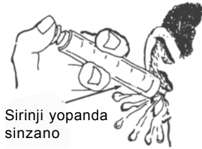
Sirinji yopanda sinzano

Ngati izi sizingathandize, chotsani zingano ku chobayira jekeseni ( syringe ) ndi kuchithira madzi otentha pangono penipeni (osati otentha kwambiri). Kenaka chipemerereni m'khutu. Chitani izi kangapo kapena mpakana chikonga chitatuluka m'khutu. Siyani ngati munthu wayamba kuwona chizungulire. Ngati utoto sukuchokabe pitani kuchipatala.